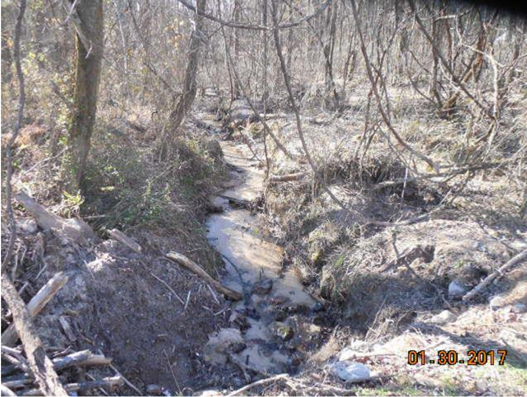
Photograph 1. Inlet