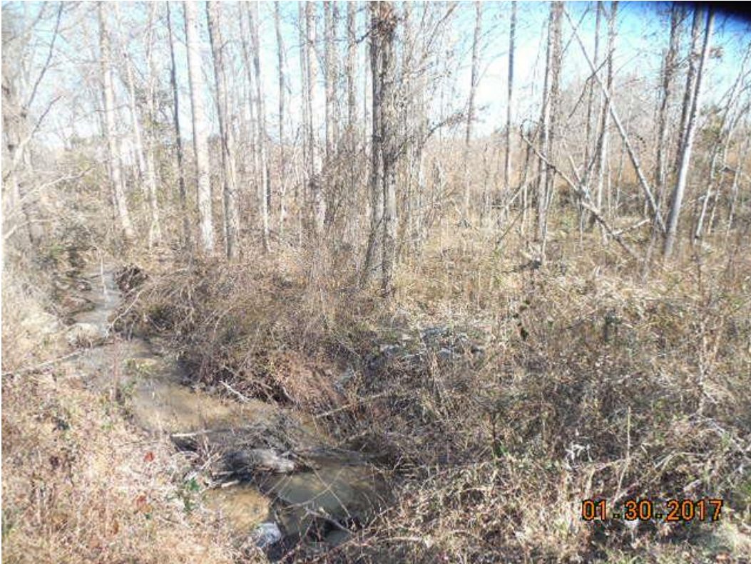
Photograph 2. Outlet